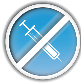
Syringes / Needles