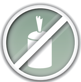
Facial / Baby wipes