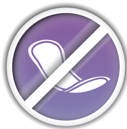
Sanitary towels / Panty liners / Incontinence Pads