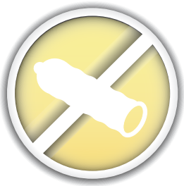
Condoms / Femidoms