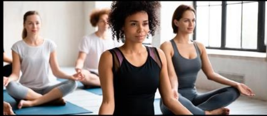
CASUAL / HARD TO REACH