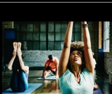
HEALTH & WELLBEING